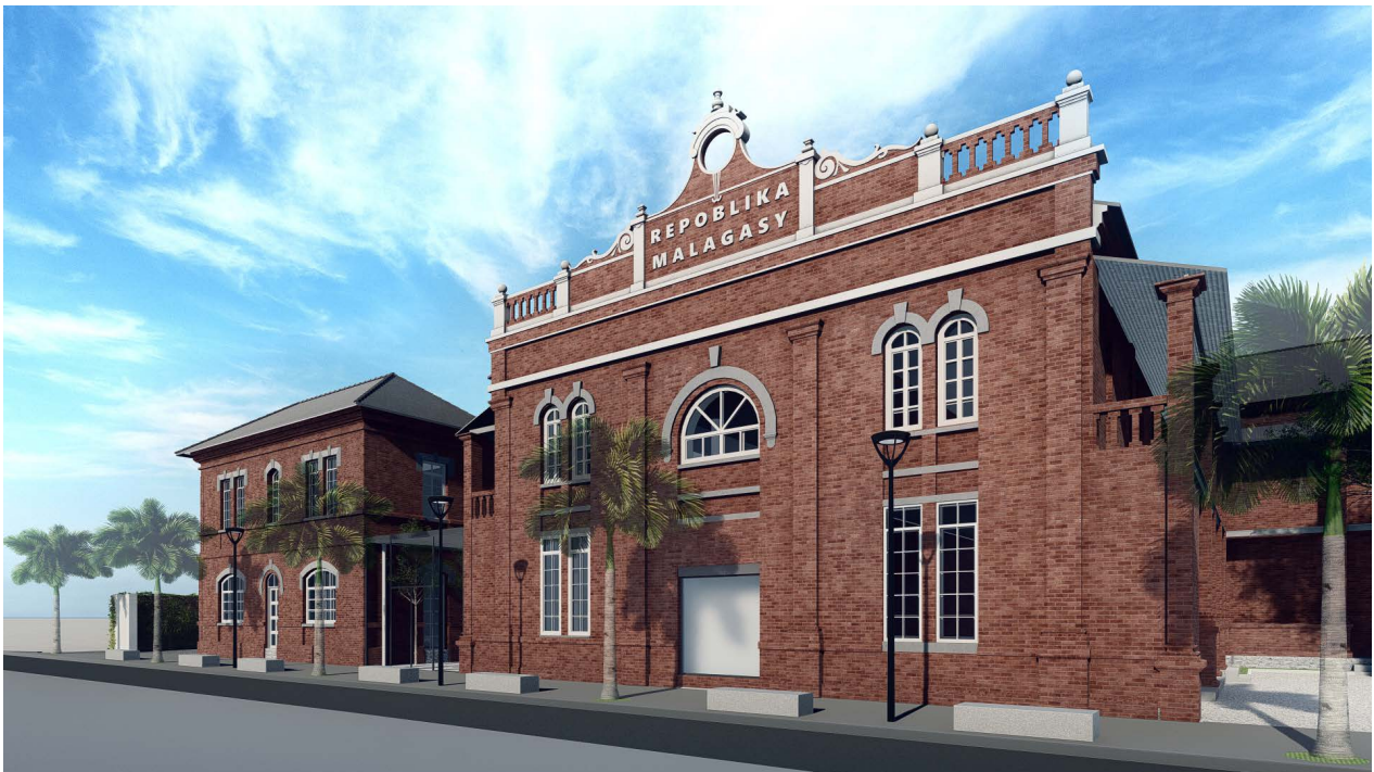
Fondation H new venue, Antananarivo, Madagascar © Fondation H and Architecture Otmar Dodel

The first private contemporary art foundation in Madagascar and the first cultural institution of this scale in the country, Fondation H will inaugurate its new 1,500-square-metre space in the heart of the Malagasy capital, on 28th April 2023.